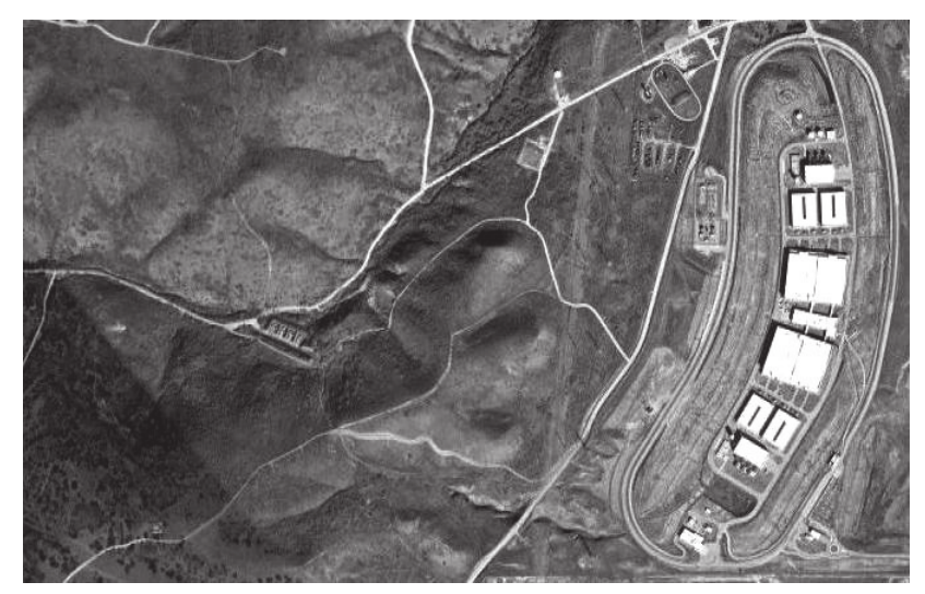
Intelligence Community Comprehensive National Initiative Data Center in Utah