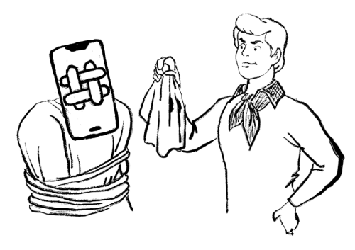
P.E.T. Guide 32

Each instance of the app only supports one account. So you cannot have multiple accounts on the same device. This is not an issue if you are using Briar just to talk with a close group of friends, but makes it difficult to use Briar for multiple different projects or networks you would otherwise want to compartmentalize. Briar provides several security-based justifications for this, and a simple one is as follows: if the same device uses multiple accounts, it could theoretically be easier for an adversary to determine those accounts are linked, despite using Tor. If the caretaker and the ghost are never seen online at the same time, there's a good chance they are using the same cell phone for their individual Briar accounts. There are other reasons, and also potential workarounds, but for now having multiple profiles on the same device is not supported.